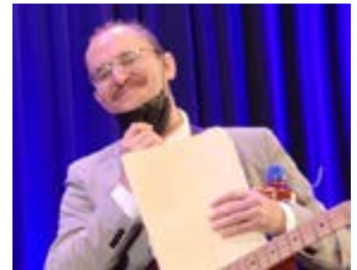
"The show must go on!" An ailing Tommy, "cracking a smile" below his mask after the second show.