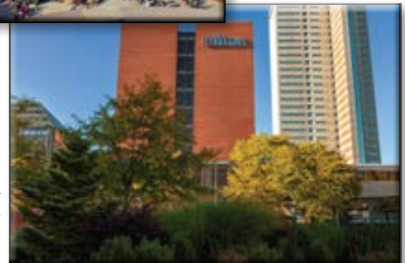
The Downtown Hilton Hotel