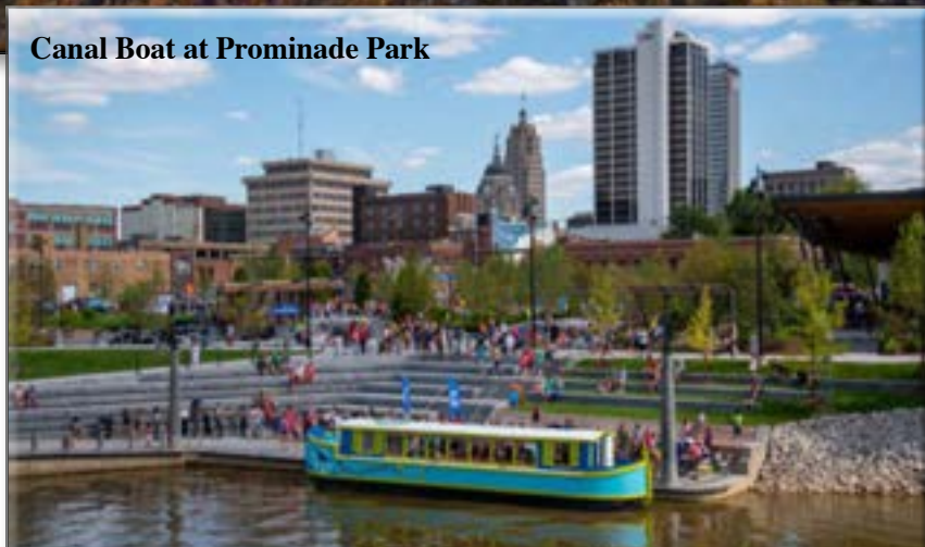
Canal Boat at Promenade Park