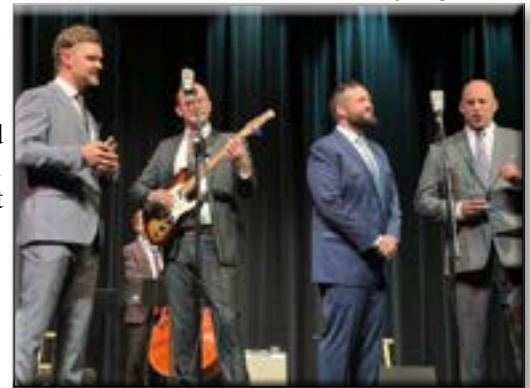
The Four Freshmen played Milton Saturday in a gift for the community.