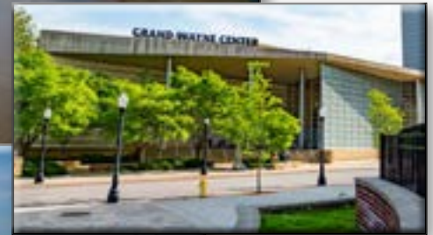
Grand Wayne Convention Center