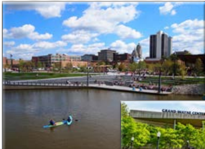
Promenade Park - Riverside

Find many attractions within easy walking distance. Enjoy a variety of shops and restaurants in downtown Fort Wayne, visit the Historic Embassy Theatre, the indoor oasis at the Botanical Conservatory and the beautiful Cathedral of the Immaculate Conception across the street from the Convention Center. Tour the Fort Wayne Art Museum. Explore your family history at the Allen County Public Library, boasting the 2nd largest Genealogy Department in the United States with helpful, on-staff Genealogists. Take a walk around Parkview Field, voted the #1 minor league ballpark in the country. Or walk four blocks down the Harrison Street corridor to the new Promenade Park on the Riverfront offering scenic views and urban adventure. Don't miss the historic Landing with its many shops and restaurants.