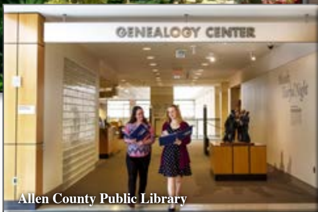
Allen County Public Library