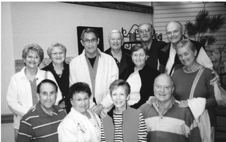
What a group!