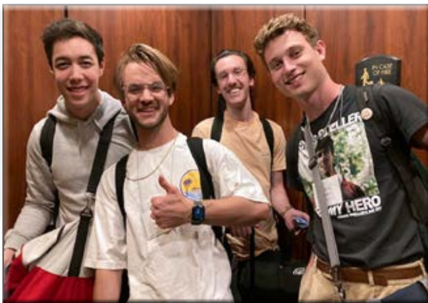
The Bean Tones