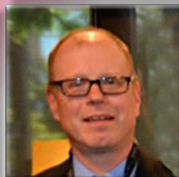
Our New President, Her Officers and Board of Directors