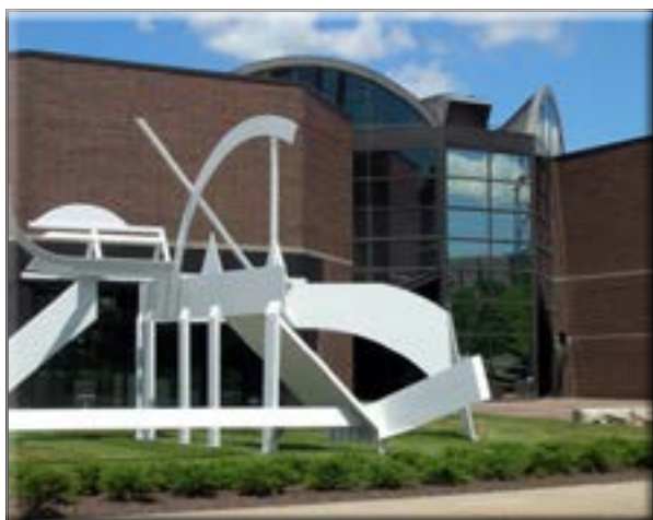
While in Fort Wayne, tour the Museum of Art