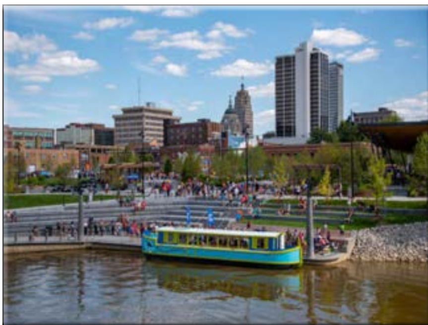
Or, enjoy a canal boat ride at Promenade Park.