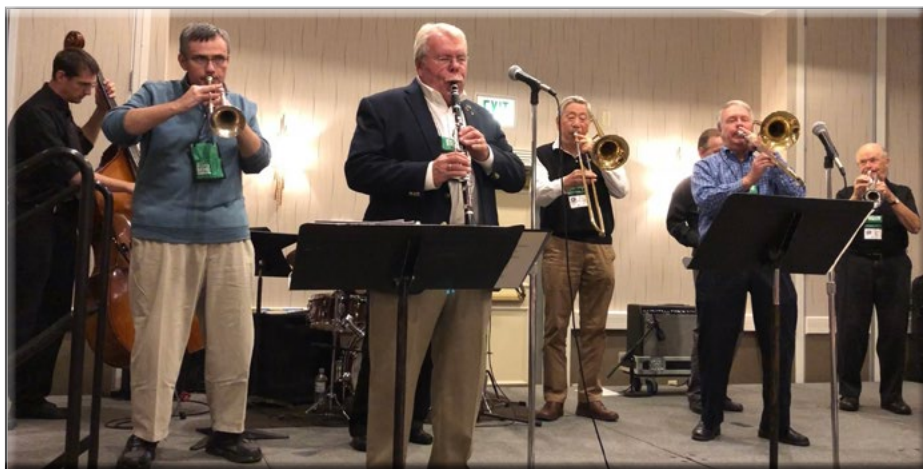
THE FOUR FRESHMEN SOCIETY “ALL-STARS”