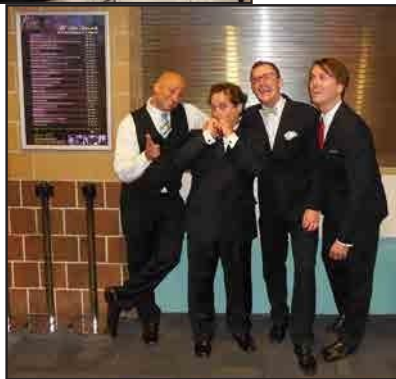
Ready to go home for Christmas.