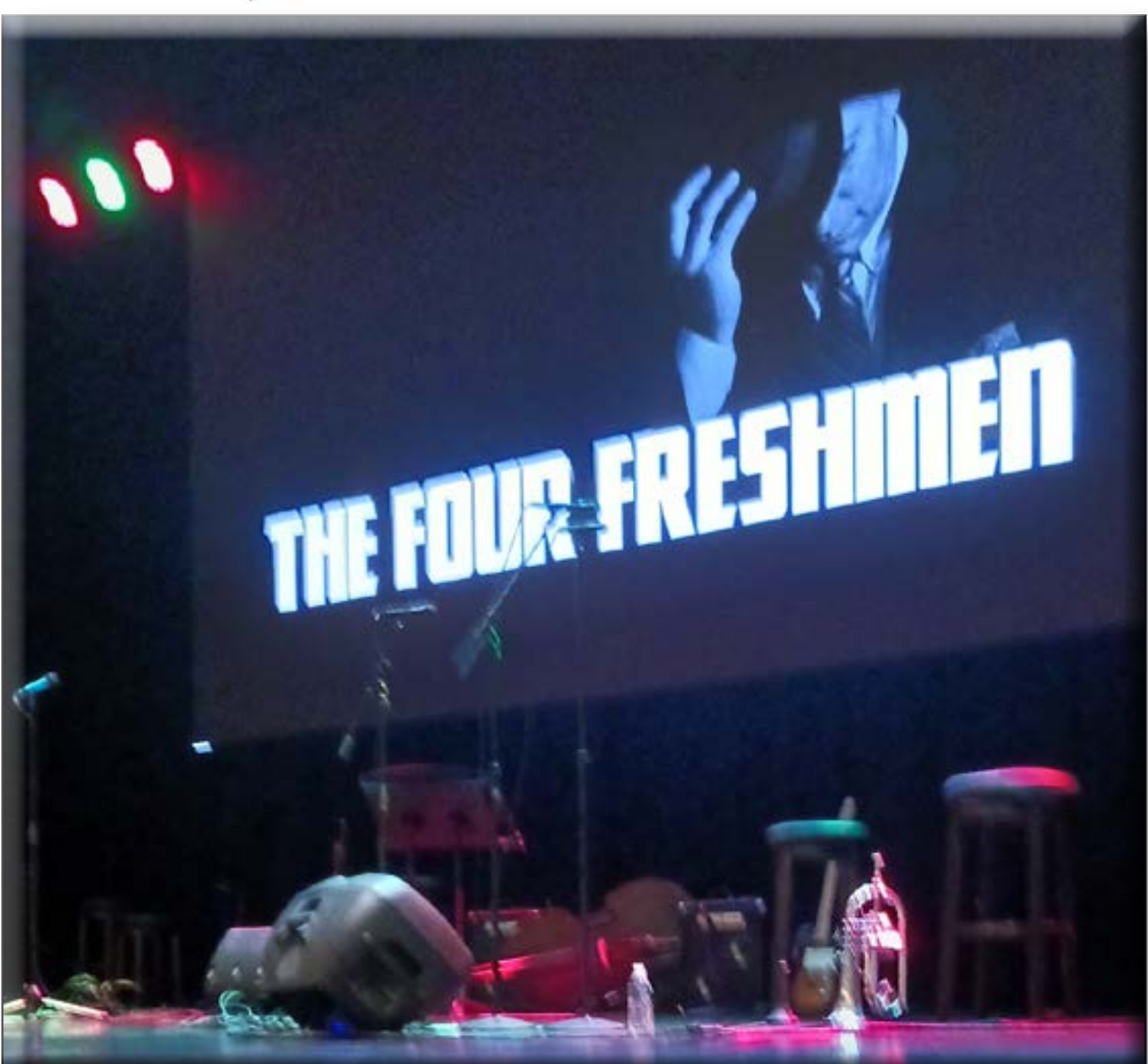
The Stage is set and ready for The Four Freshmen in Shell Point, Ft. Meyers.